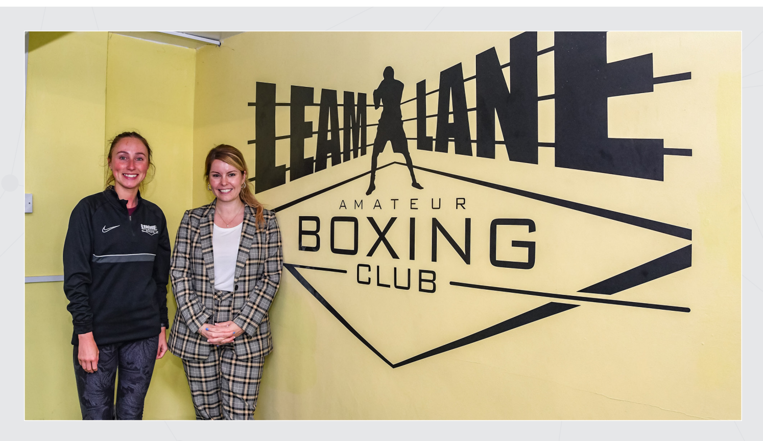
Priority 5: Support for victims