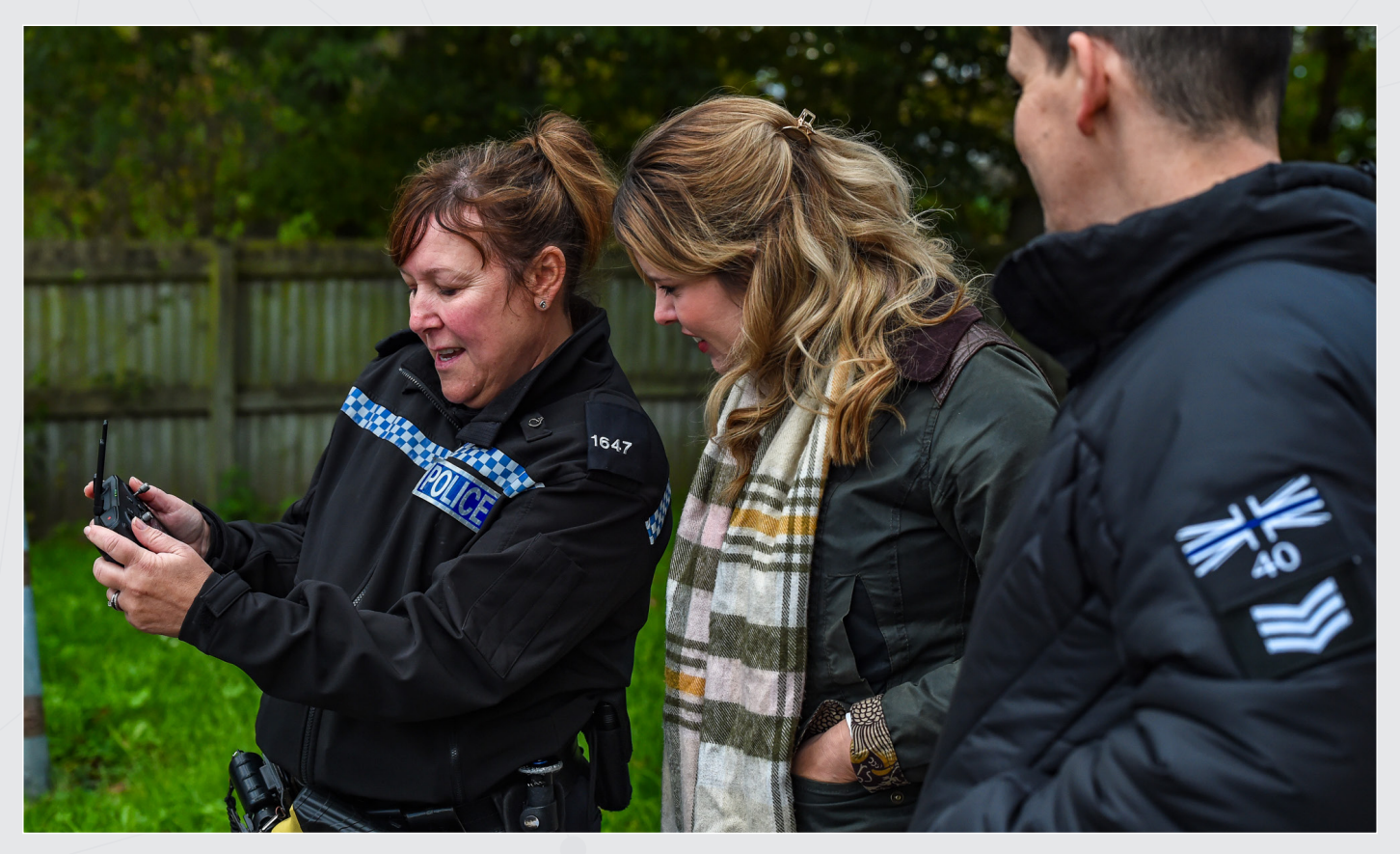
Priority 3: Preventing violent crime